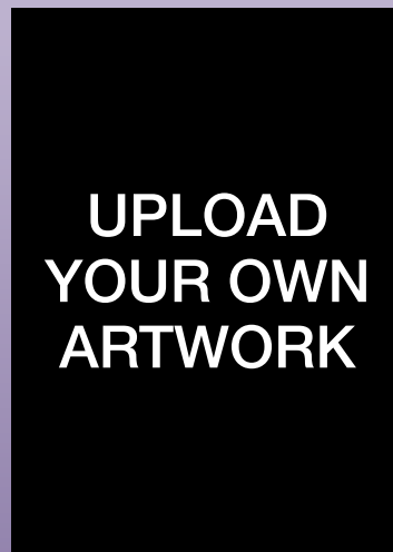
OWN COVER 210mm (W) x 297mm (H)*